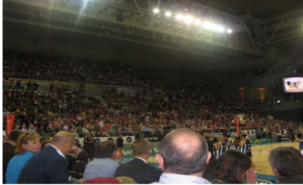
Trustees went to Australia vs England netball game