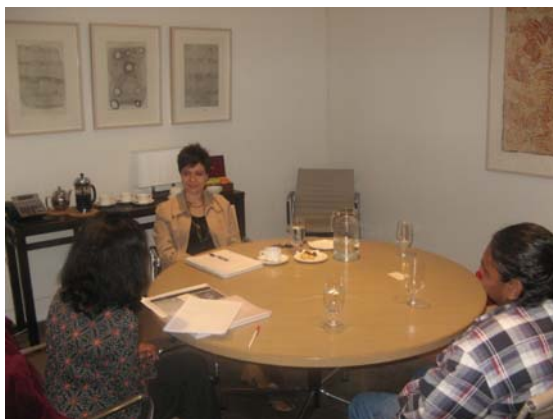
Meeting with Myer Foundation to talk about partnership projects.